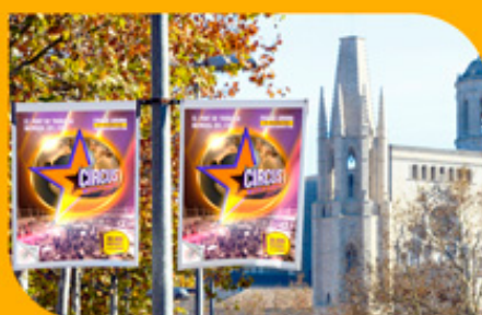
PUBLICITY on social networks and external advertising