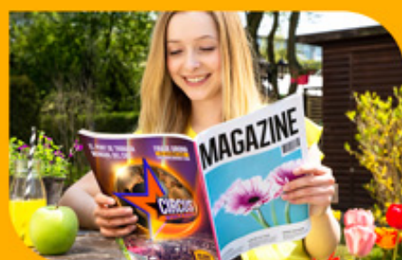
ADVERTISING in specialized magazines and websites

We have an extensive DATABASE that covers a large part of the world's circus sector, enabling us to have a direct impact on THE ENTIRE CORE TARGET of the Fair: entrepreneurs, casting directors, artists, aficionados, and so on, reaching them directly by way of: